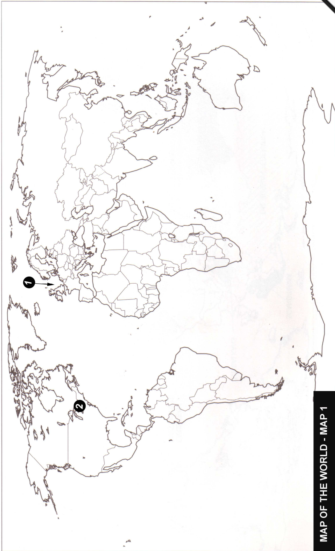
MAP OF THE WORLD - MAP 1