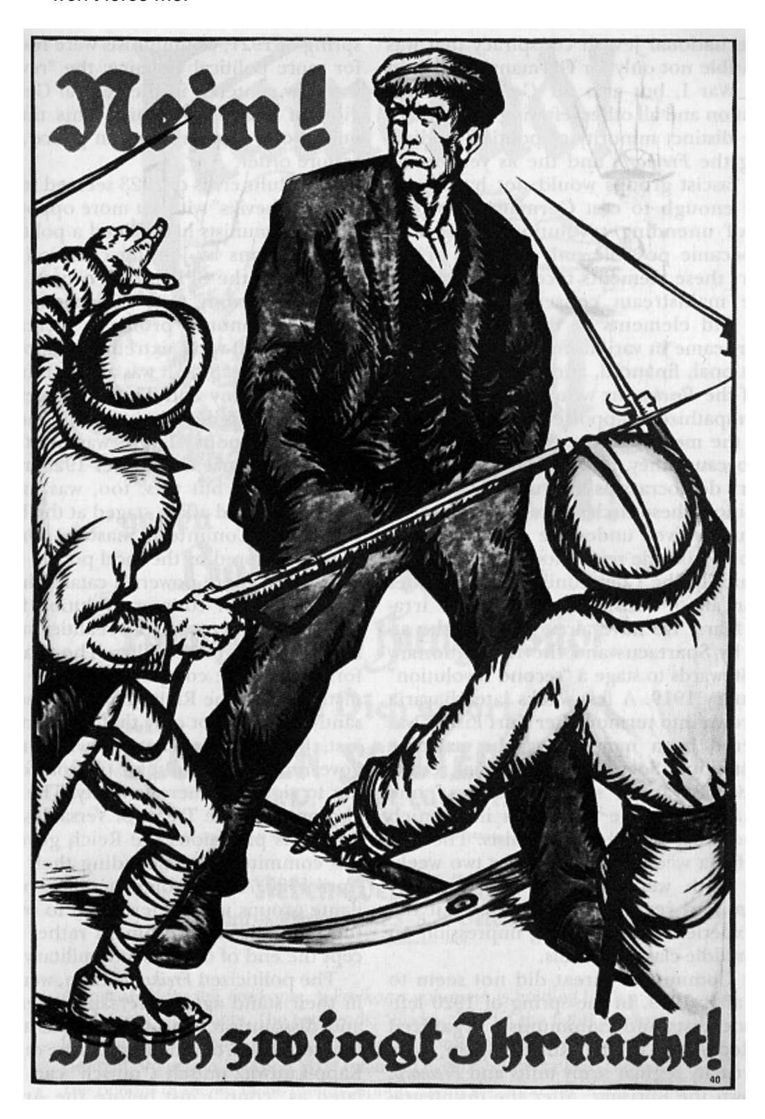
SOURCE E: A German government poster from 1923, after the invasion of the Ruhr. It says 'No! You won't force me!'