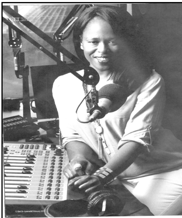
[Umtfombo: Get It , 2015]