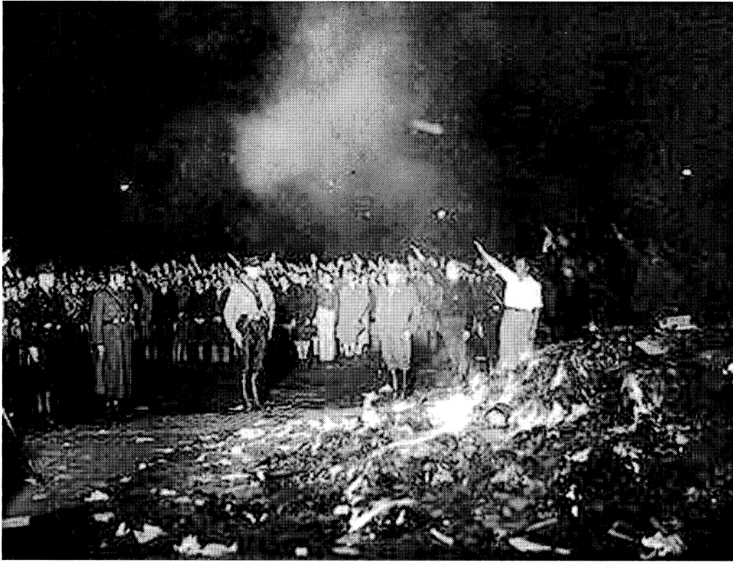
The burning of 20 000 books in Berlin on the night of 10 May 1933, as Stormtroopers look on.