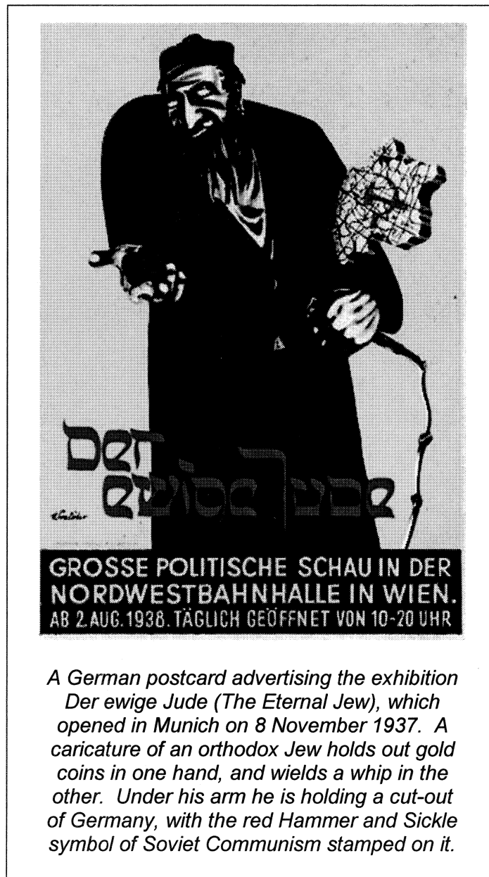
A German postcard advertising the exhibition Der ewige Jude (The Eternal Jew), which opened in Munich on 8 November 1937. A caricature of an orthodox Jew holds out gold coins in one hand, and wields a whip in the other. Under his arm he is holding a cut-out of Germany, with the red Hammer and Sickle symbol of Soviet Communism stamped on it.