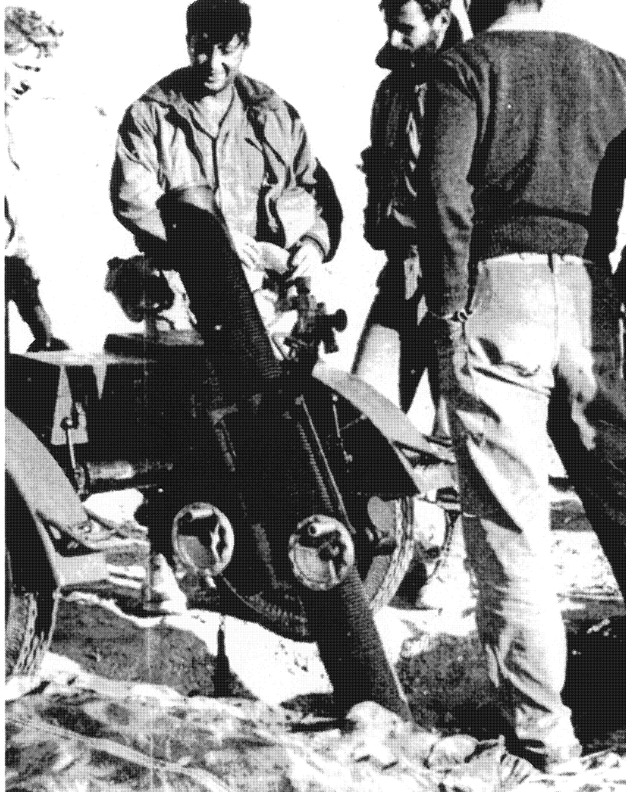
Three mortars captured in a raid. In the centre is Arik Sharon.