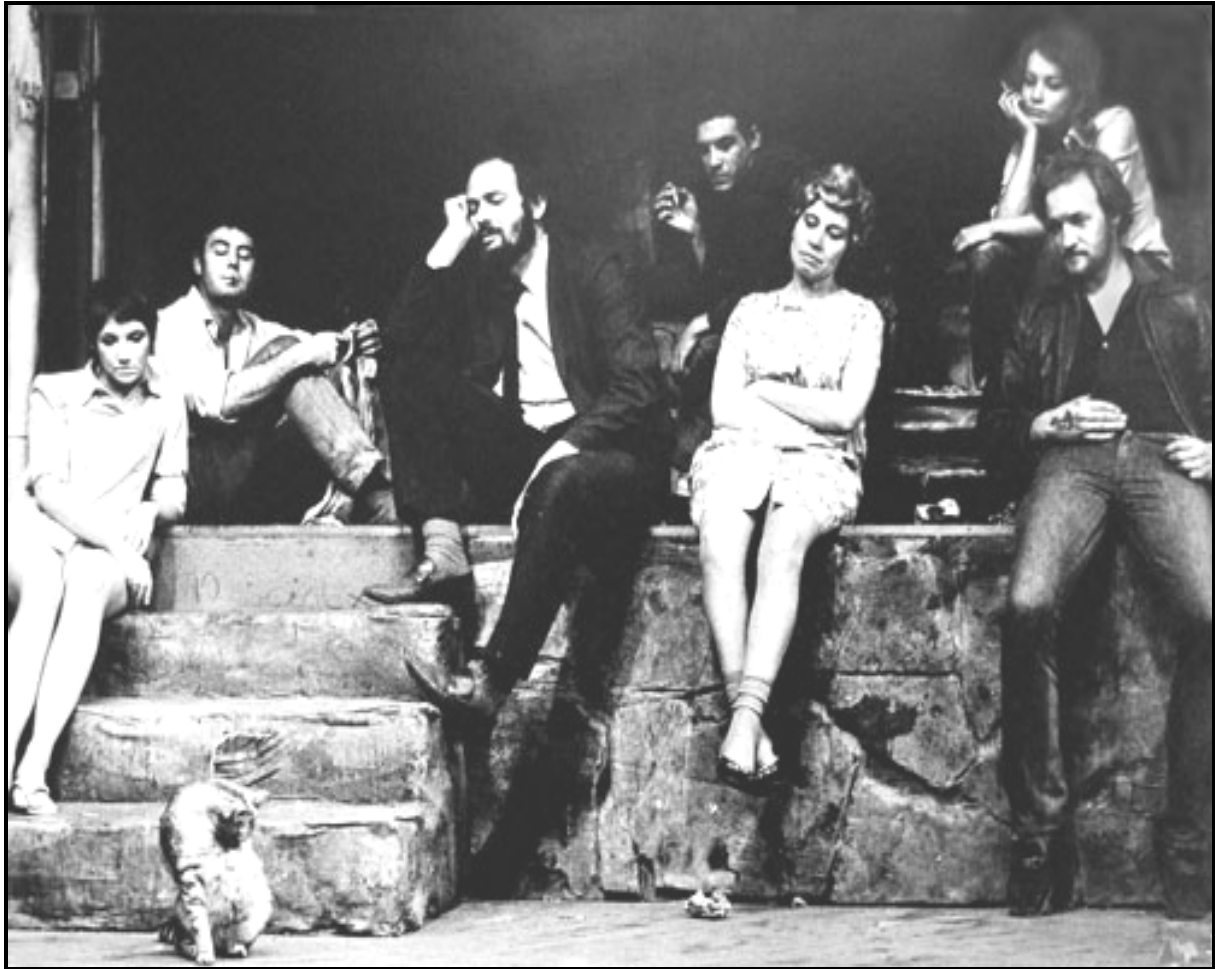
The original cast of Siener in die Suburbs – 1971