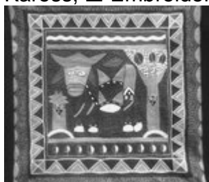
A placemat by Kaross