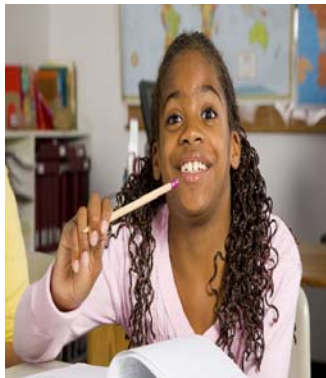
Dark skin tone