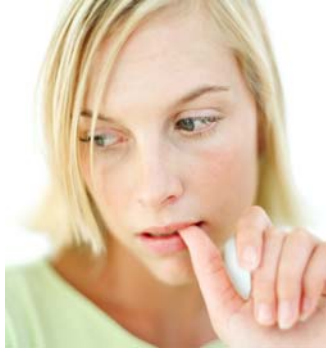
Fair skin tone

This could be answered through the use of pictures illustrating different colours e.g. skin tones, by using magazine cut-outs of different people or designing a mood board