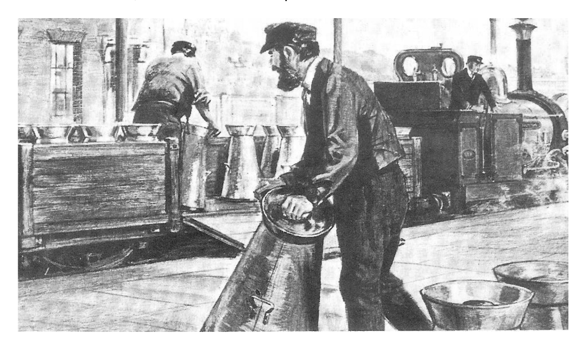
Milk churns being taken by train from farms in the west of England to the City of London.

22 Look at the illustration, and then answer the questions which follow.