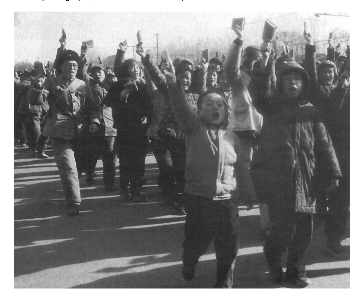
A photograph of Red Guards on the streets of Beijing during the Cultural Revolution.

16 Look at the photograph, and then answer the questions which follow.