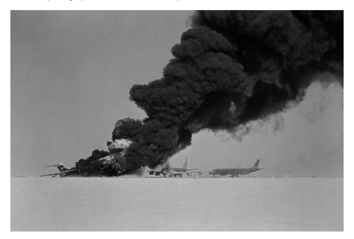
A photograph of a hijacked airliner, Jordan 1970.

21 Look at the photograph, and then answer the questions which follow.