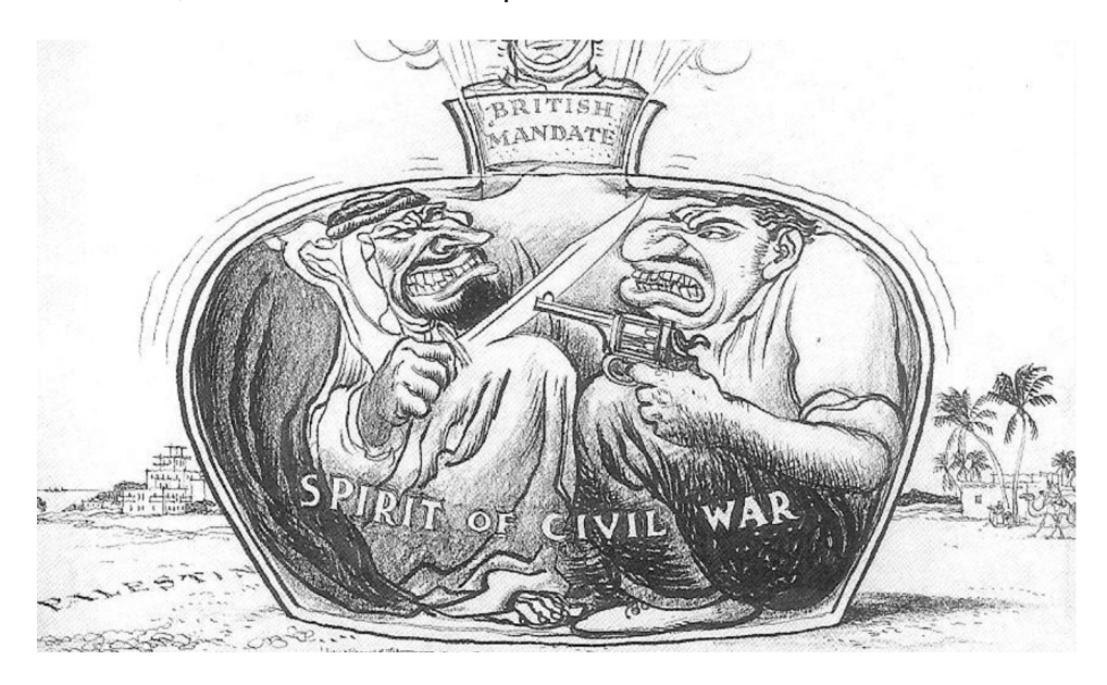
A cartoon published in a British newspaper, September 1947.

20 Look at the cartoon, and then answer the questions which follow.