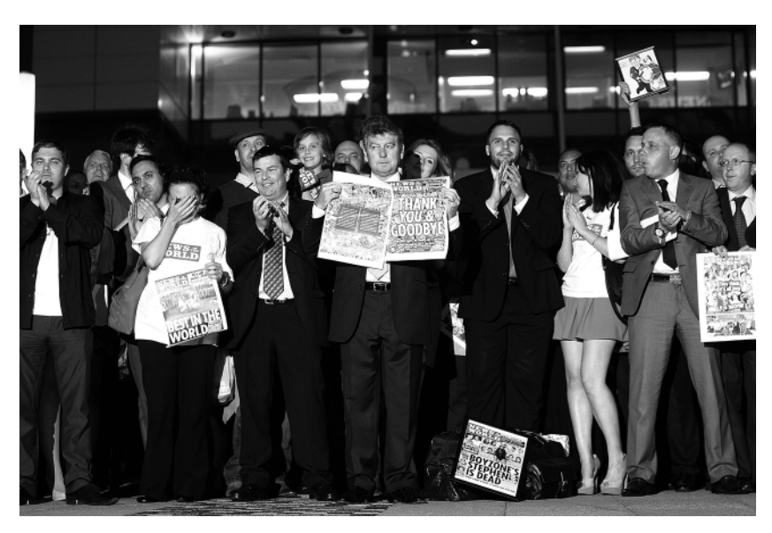
Item C The News of the World closes in July 2011

News International Group Ltd, the owners of the News of the World , decided to close the paper after its staff were accused of 'hacking' private phones, including that of a missing schoolgirl who was later found murdered. The editor is shown holding the last edition of the paper.