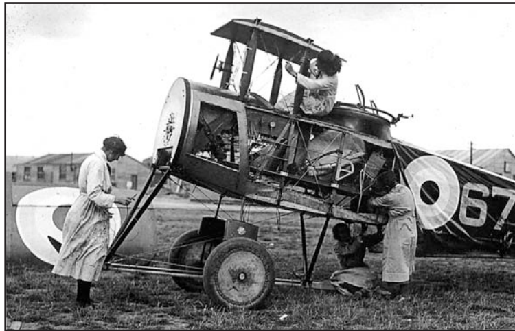
[Women air mechanics in the First World War]