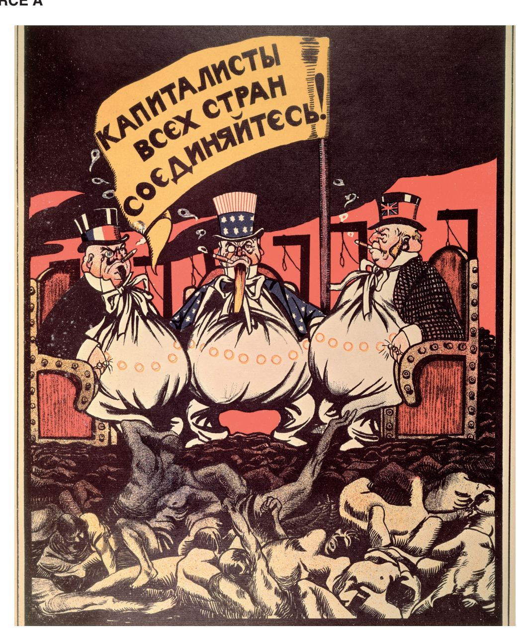
A Soviet view of the League of Nations. The slogan on the flag says, 'Capitalists of the world unite.' This cartoon was published at the time of the establishment of the League.