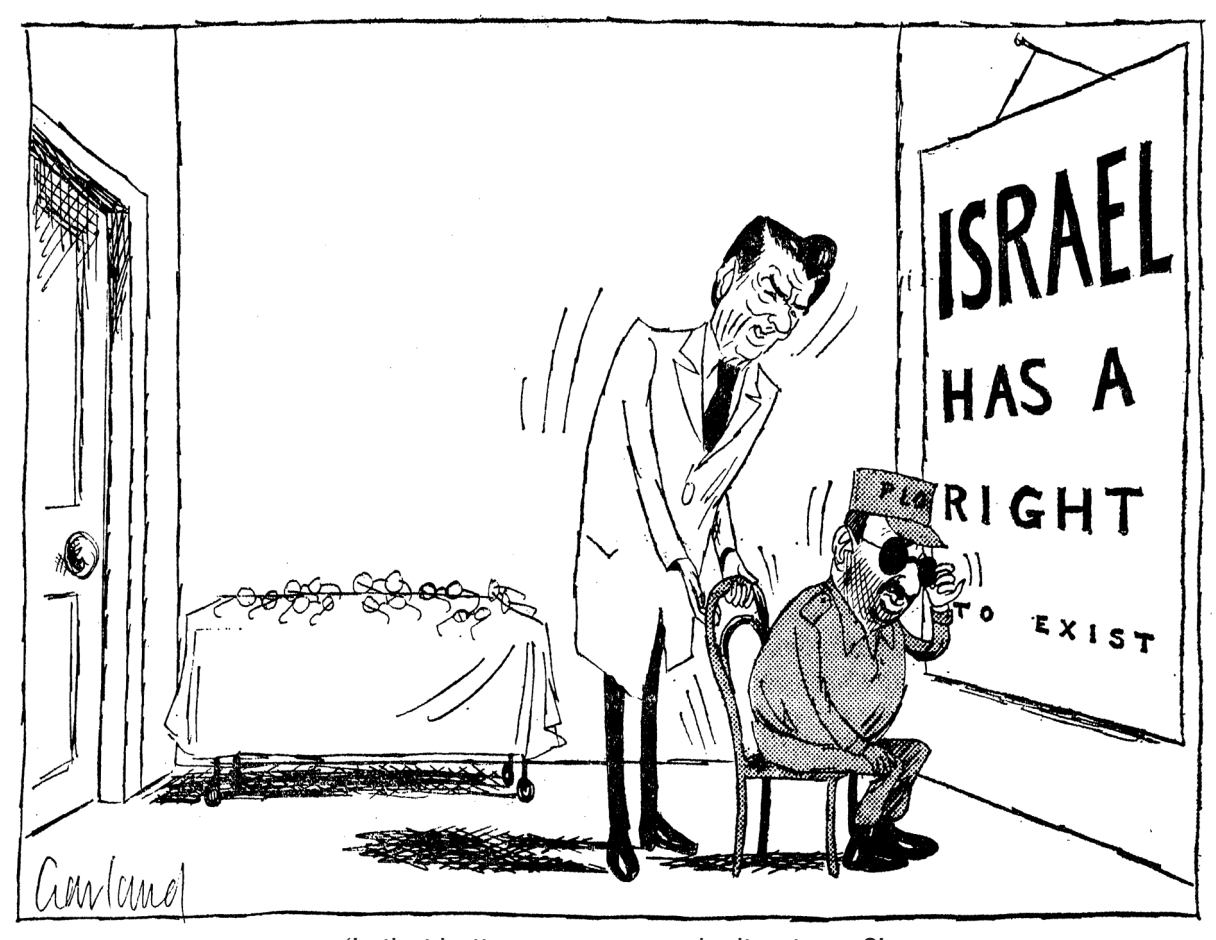
'Is that better – can you make it out now?'

A cartoon published in a British newspaper, 1982. The men shown in the cartoon are US President Reagan (standing) and Yasser Arafat.