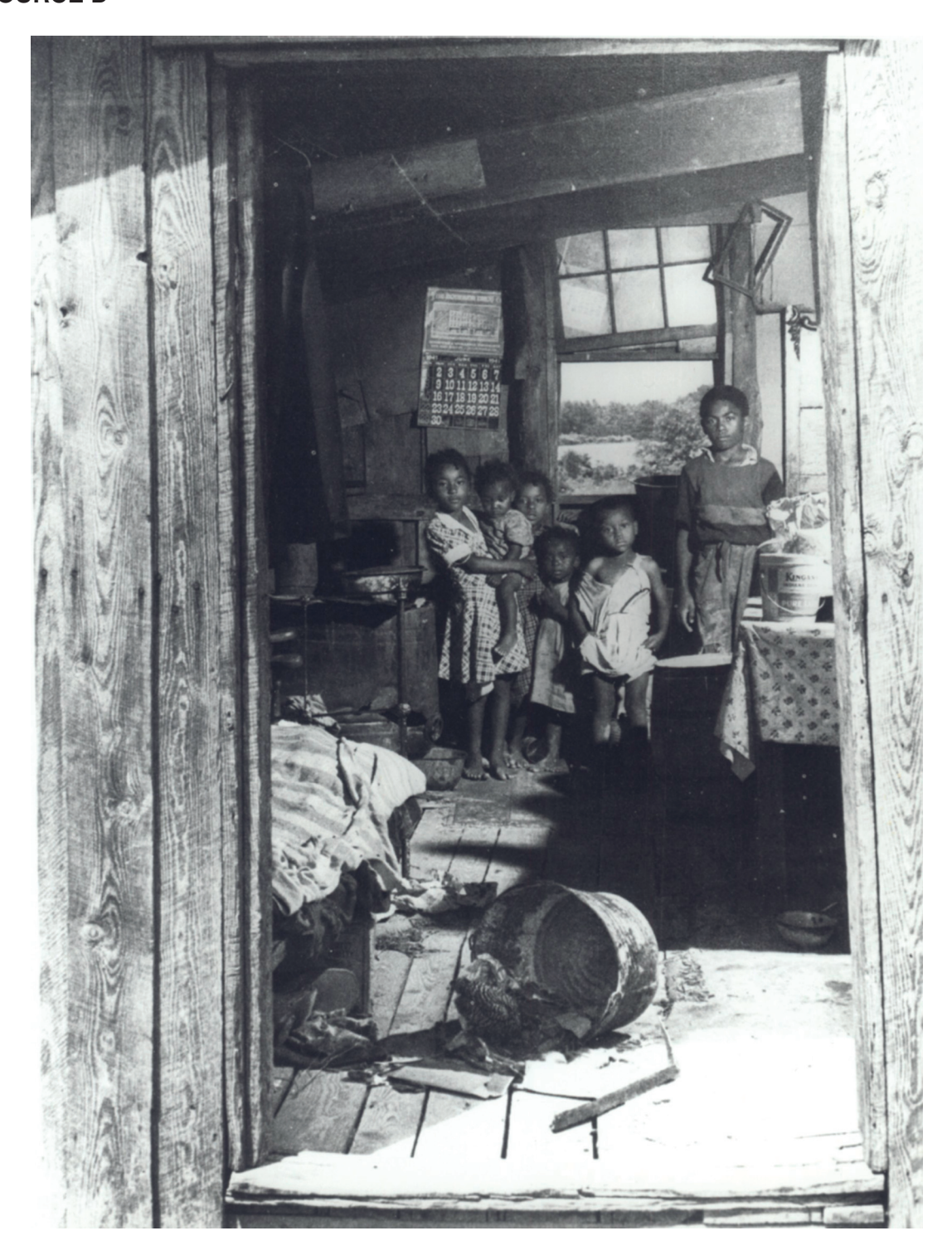
A photograph of a black family and their home in Virginia, in the 1920s.