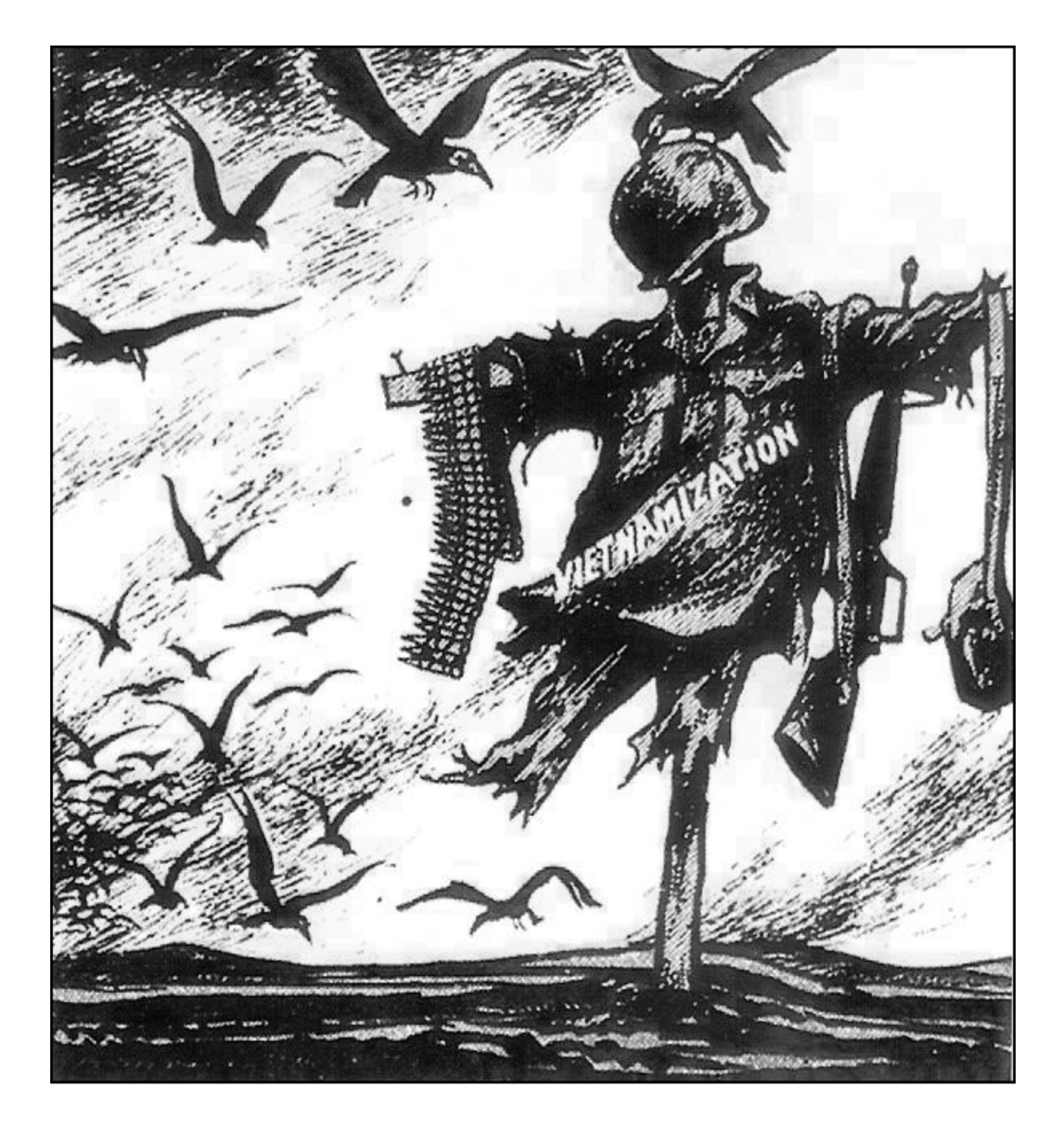
An American cartoon, published in 1972. The crows represent the Communist forces.