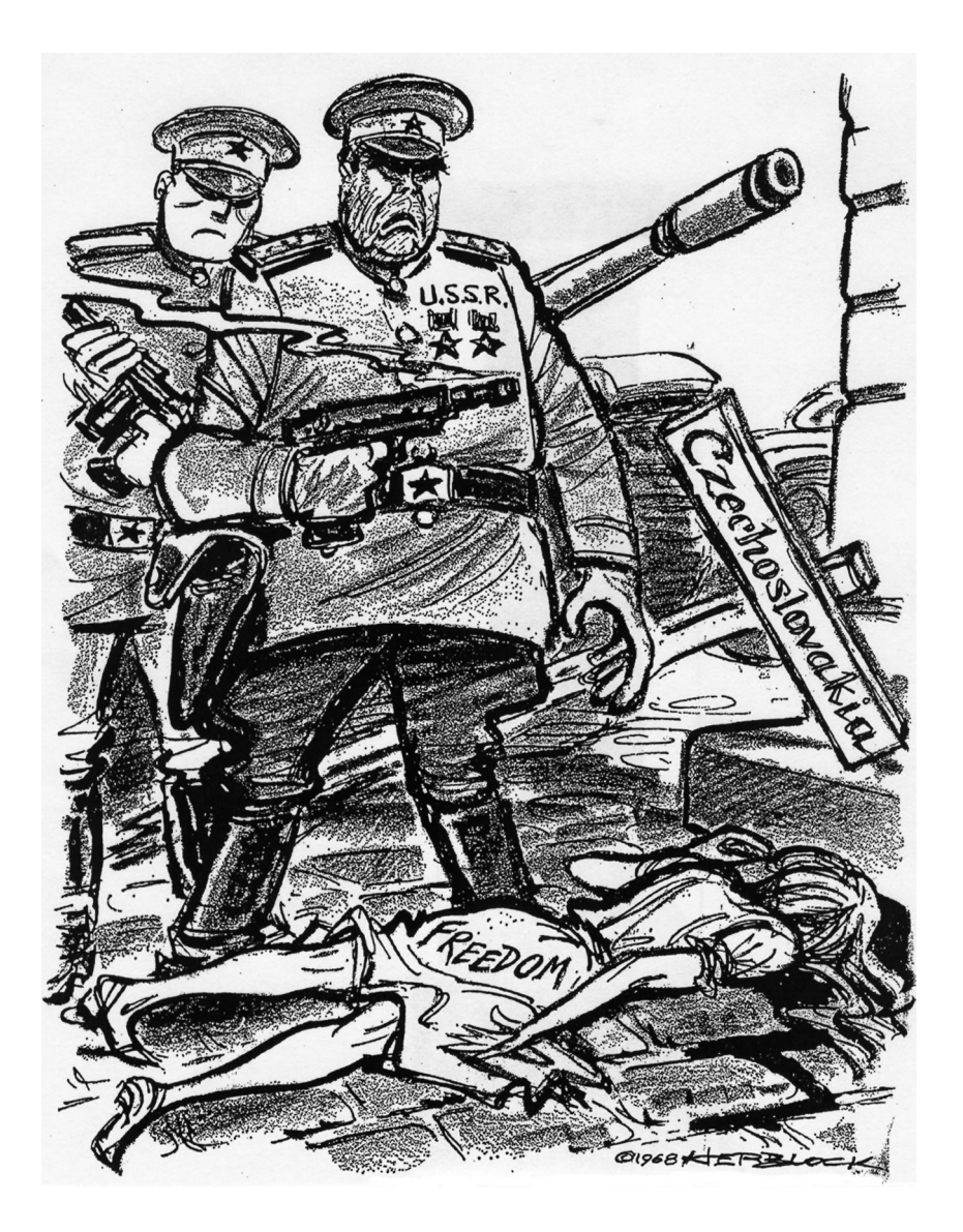
An American cartoon published in September 1968. The Russian soldier is saying, 'She might have invaded Russia.'