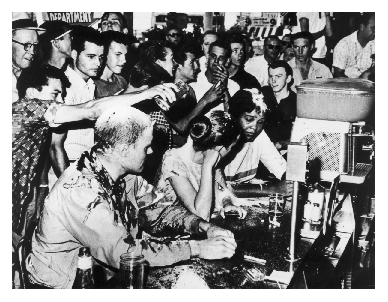
A photograph taken in a restaurant in Jackson, Mississippi, June 1963.