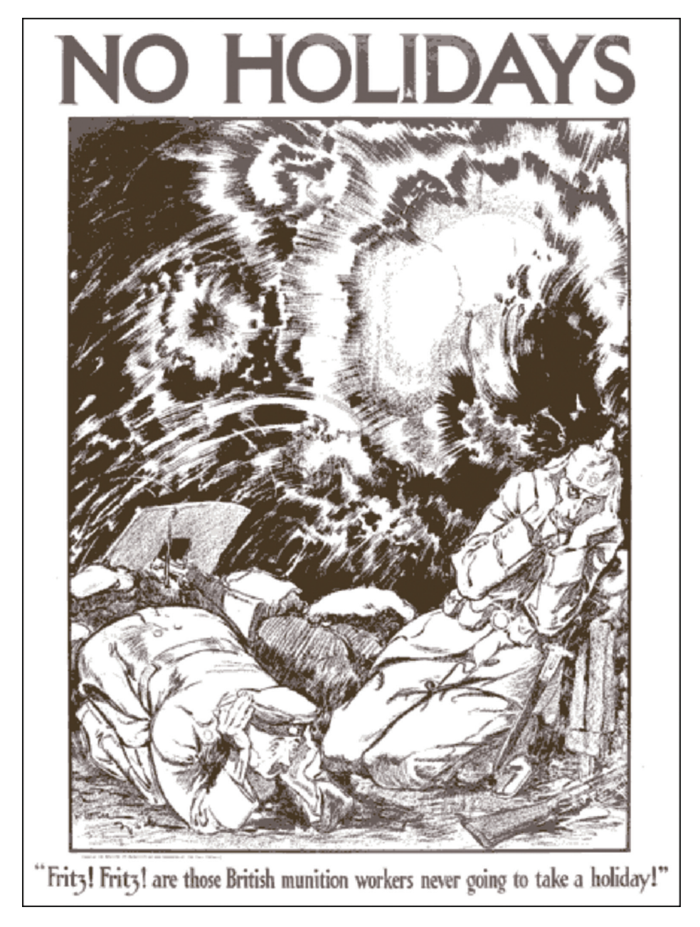
A British government poster published in July 1916.