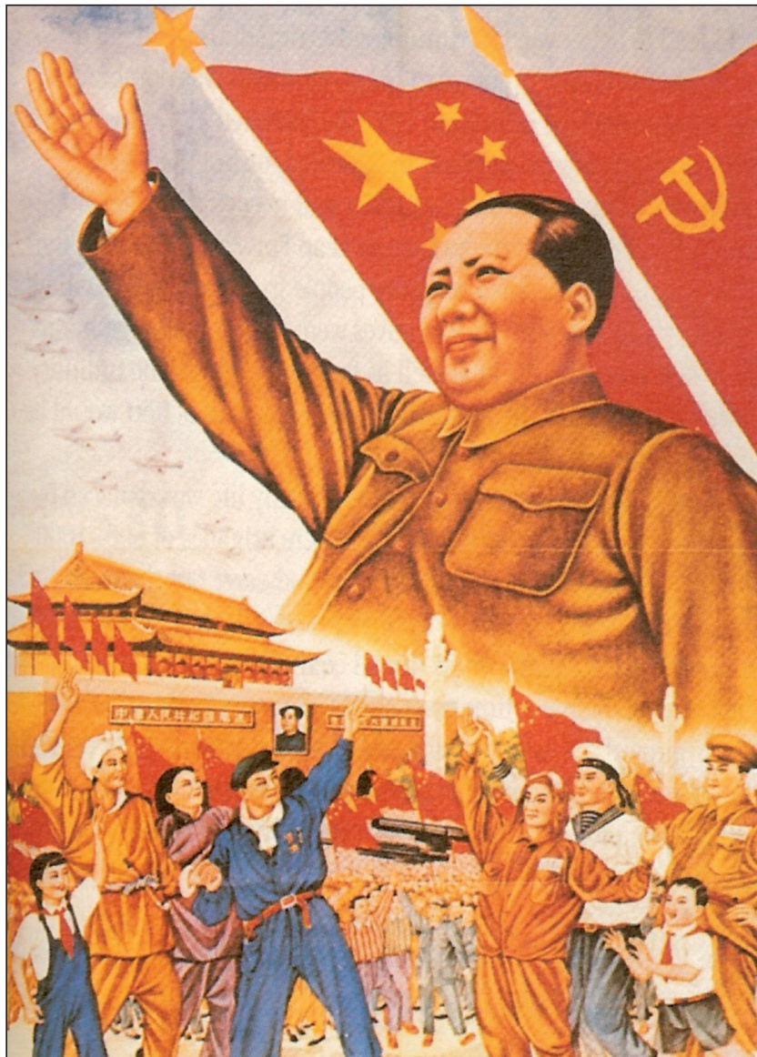
A poster published by the Chinese government in the 1950s.