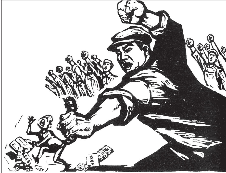
A poster published by the Chinese government in 1966 during the Cultural Revolution.

A modern historian writing in 2008 about events in China in 1957.