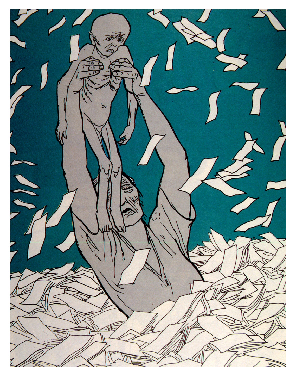
A cartoon from a German magazine published in 1923. The mother is calling for bread.