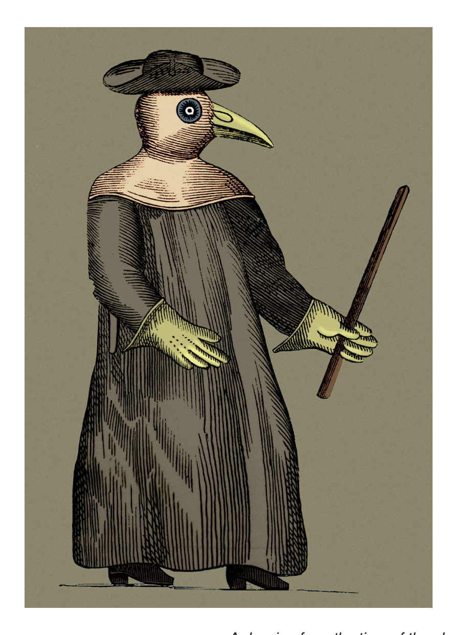
A drawing from the time of the plague in the 1660s.