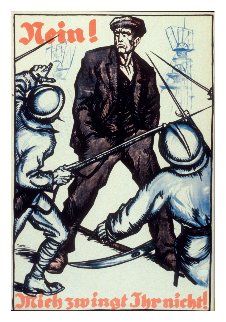
A poster published by the German government in 1923. The German miner is saying to French soldiers 'No! I will not be forced'.