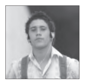
This man is a ...