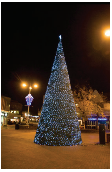
... and by night.

From a health and safety point of view, it is the perfect Christmas tree.