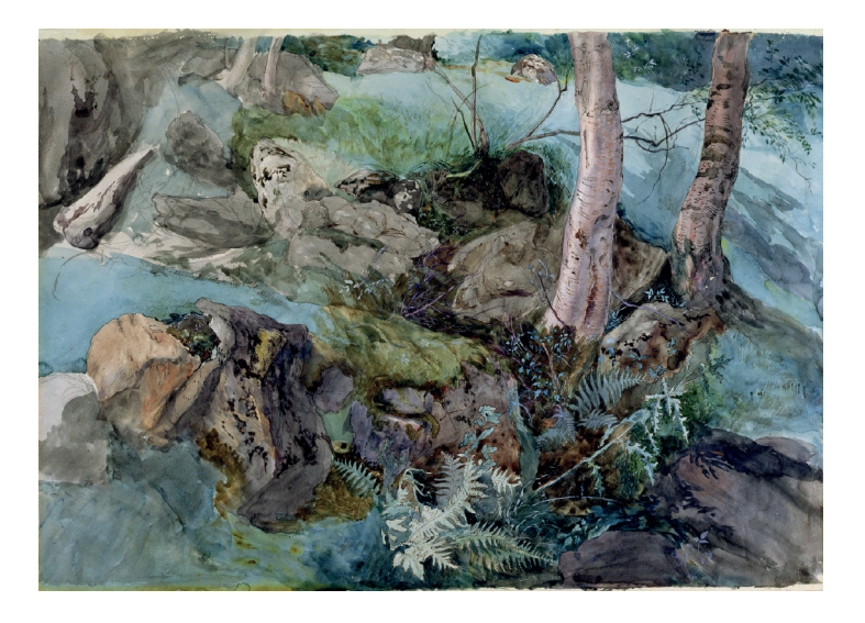
John Ruskin Rocks and Ferns in a Wood at Crossmount, Perthshire painting

Wildlife habitats are a source of inspiration for artists, designers and craft workers. John Ruskin's painting is made up of a range of carefully observed marks, depicting the delicate ferns and flowing water.