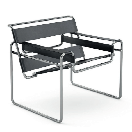
Marcel Breuer Wassily Chair product design

The invention of the 3D printer inspired the fashion design group threeASFOUR to produce a dress that reflects their interest in technology.