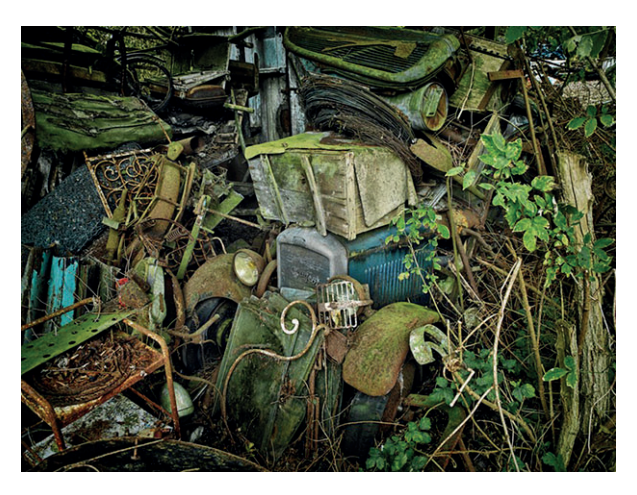
Dieter Klein Peugeot, 1928 photograph

Old possessions can trigger memories of the past. Deiter Klein's photograph shows a variety of discarded objects.