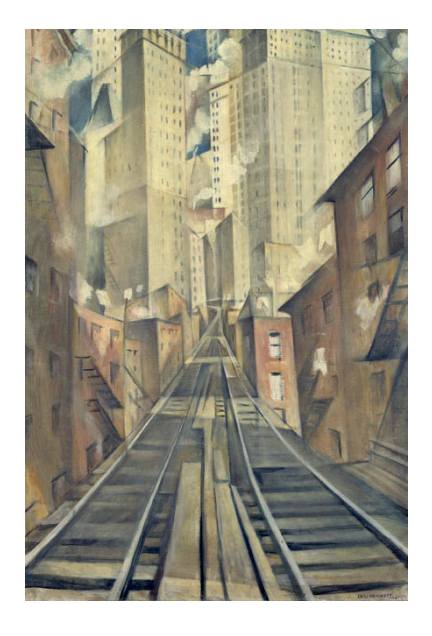
Christopher Nevinson The Soul of the Soulless City painting

Some maps can provide more than just geographical information. Hennie Haworth's hand-drawn map incorporates information about the city.