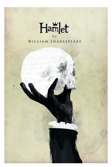
Chris Hall Hamlet (2013) graphic design

Artists, designers and craft workers can use music, literature, and film as a source of inspiration for their artwork.