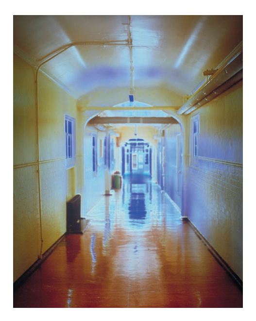
Catherine Yass Corridors photograph

Artists, designers and craft workers use light and colour to illuminate spaces and enhance our environment. In her photograph Catherine Yass captures the light reflecting in an empty hospital corridor.