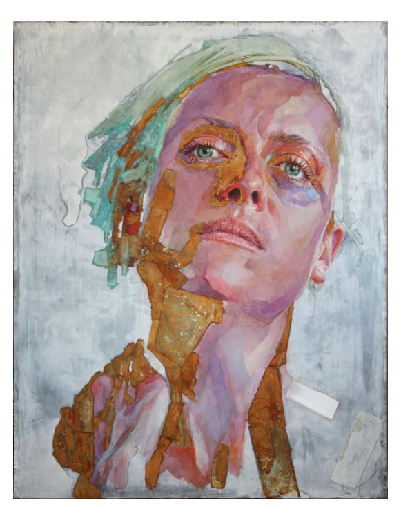
Piet van den Boog The Face Forgives the Mirror painting

Piet Van Den Boog has applied oil paint using expressive brush strokes and rust to create this portrait.