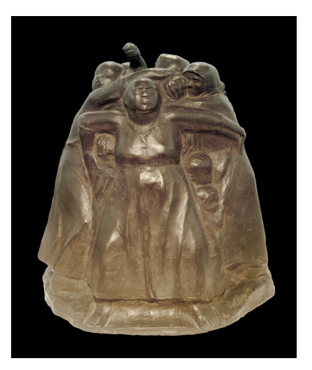
Käthe Kollwitz Tower of the Mothers sculpture

A reflective or mirrored surface can show an accurate or distorted image. In his print M. C. Escher uses a sphere to show himself and his surroundings.