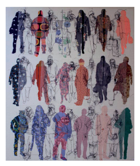
Rosie James Tourists Contemplating the British Museum textile

In her sculpture Käthe Kollwitz has reflected the strong emotion people feel as they protect others.