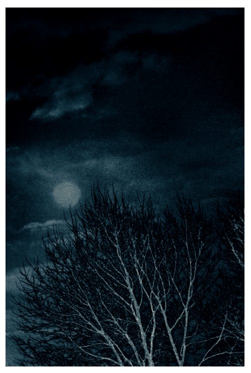
Alice Gur-Arie Harvest Moon photograph

The light reflecting from the sun and moon can make places look dramatically different as the day becomes night. Alice Gur–Arie has captured the reflected light from a harvest moon.