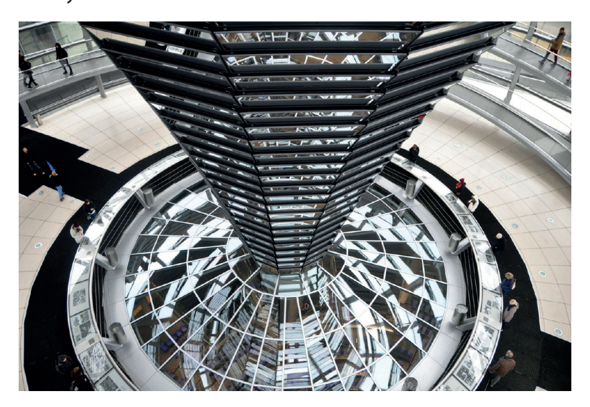
Norman Foster Reichstag Dome architecture

The dome of the Reichstag building in Berlin uses mirrors and glass to create an amazing 360-degree view of the city.