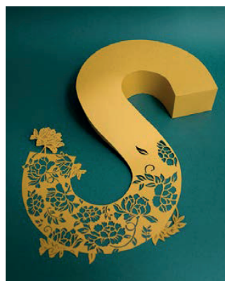
Andrea Ferrandis 'Papercut type'