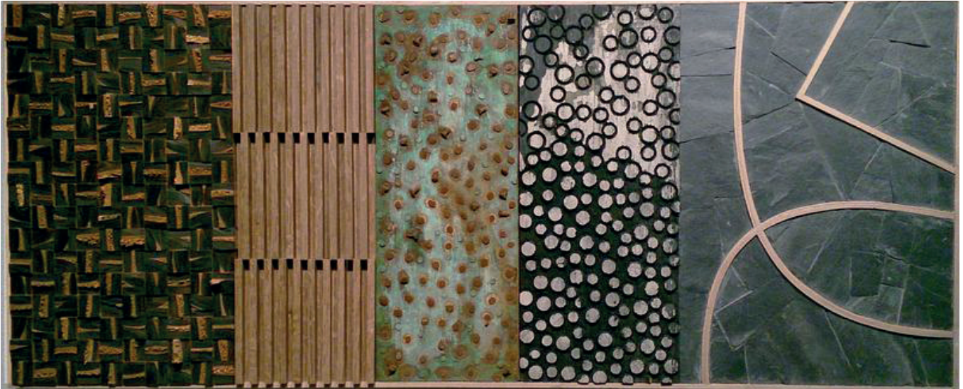
Minoru Ohira – 'From the Landscape series' 2014