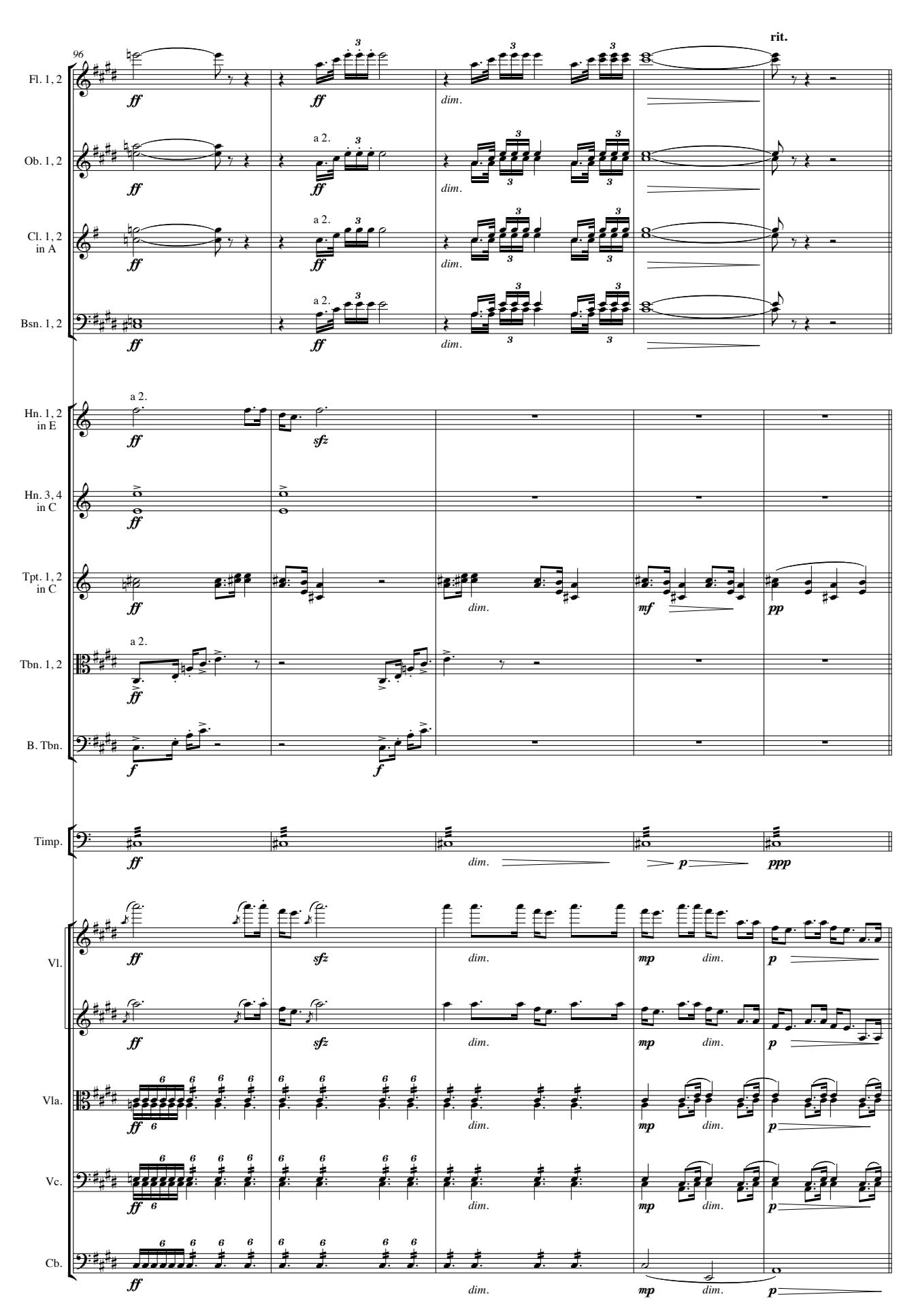
© 2010 Ernst Eulenburg & Co. GmbH, Mainz. Reproduced by permission. All rights reserved.