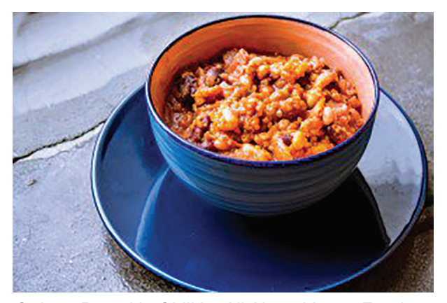
Quinoa Pumpkin Chili by All About Vegan Food.

The most common misconception out there is that you have to consume meat in order to get enough protein. This is simply not true. There may be protein in meat, but that doesn't mean that it doesn't exist anywhere else. In fact, vegans simply do what cows, pigs, sheep and chickens do; we go to the source.