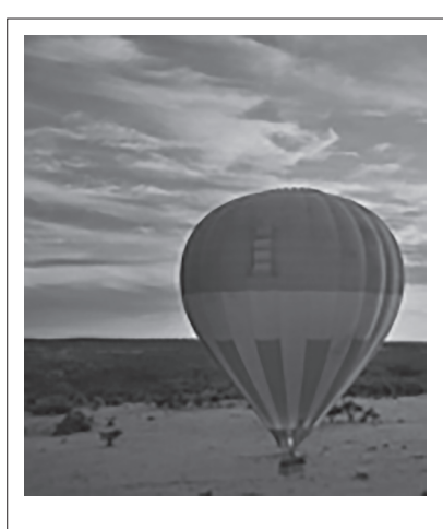
Fig. 2 for Question 3