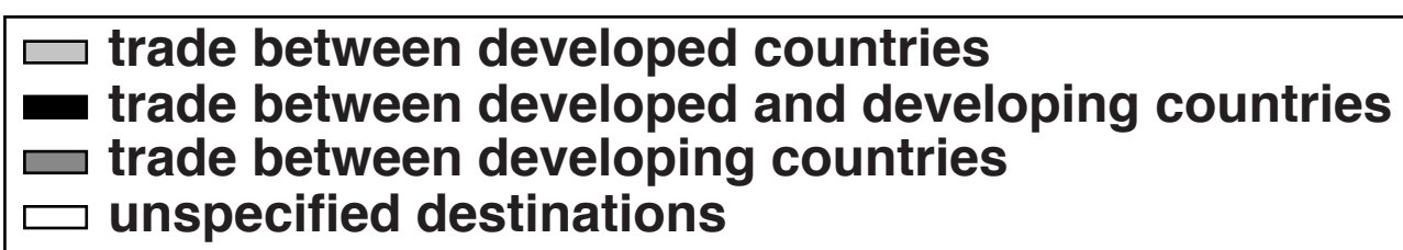
Fig. 4.2 – Shares of trade between developed countries, between developed and developing countries and between developing countries, 1990–2011

The WTO's World Trade Report of 2013 also provided useful insights into the pattern of global trade and changes in comparative advantage for selected economies and industries. Figs 4.2, 4.3 and 4.4 provide a summary of some aspects of the global pattern of trade. The extent of intra-industry trade is measured using an index. The closer this index is to 100, the more significant intra-industry trade is for a country. The closer this index is to 0, the more a country imports and exports goods and services produced by different industries. Fig. 4.5 shows changes in comparative advantage for selected industries and countries.