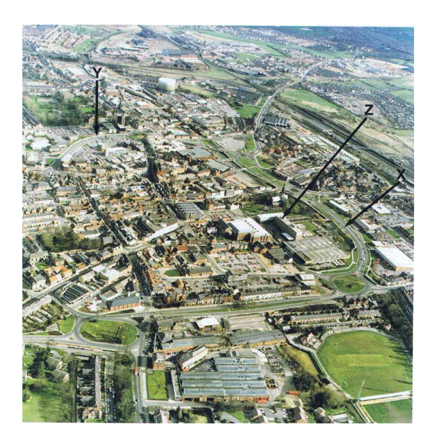
Figure 3: Darlington Town Centre